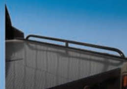
Permanent Round Rails