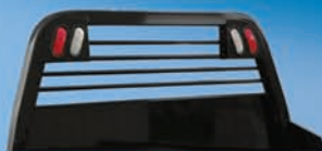
60" Tall Headache Rack